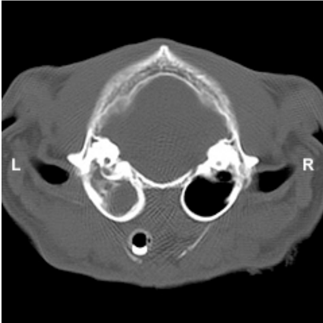
Fig 2. Axial CT Image (Abnormal Left Bulla)

In patients with concurrent neurological signs (ipsilateral Horner's syndrome, facial palsy, peripheral vestibular signs or auditory dysfunction) radiography or advanced CT or MRI is recommended prior to ear cleaning (Fig 2 & 3). If imaging studies are only performed after deep ear cleaning, it is difficult to determine if fluid present in the middle ear was iatrogenically introduced or part of the disease process. Radiographic evaluation of the bullae includes ventrodorsal, lateral, oblique and open mouth views. Unfortunately, normal radiographs do not rule out middle ear disease. CT and MRI are more sensitive than plain radiography in detecting changes in the bullae and surrounding soft tissues.